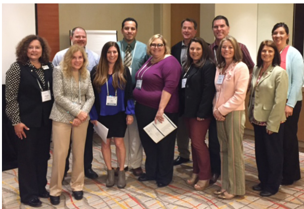
ACCJC Conference attendees

Twelve employees representing faculty, staff, and administration attended the 2017 ACCJC Conference: Partners in Excellence in Irvine April 4 – 7. The conference provided attendees the opportunity to explore multiple ways colleges and the accrediting commission work together to ensure that each student has an outstanding experience in college.